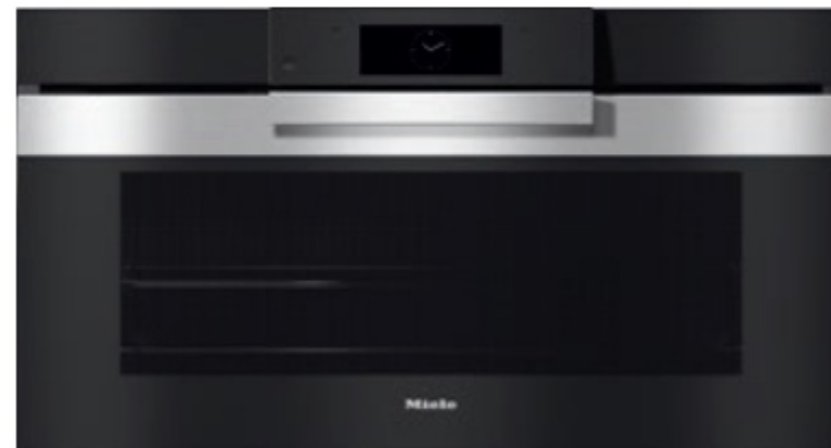
BUILT IN OVEN - 90CM