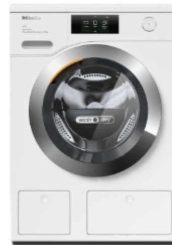
FREE STANDING WASHING MACHINE