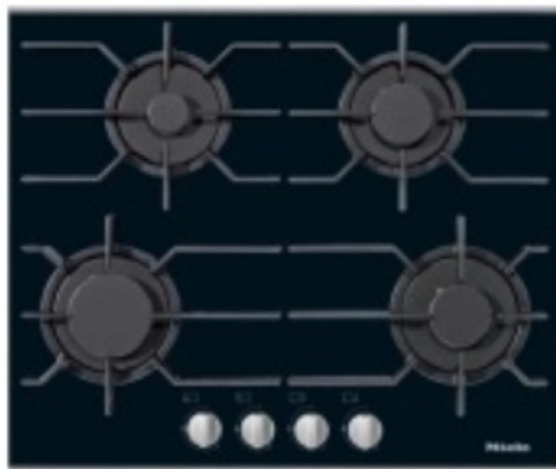
GAS HOB WITH 4 BURNERS – 60CM