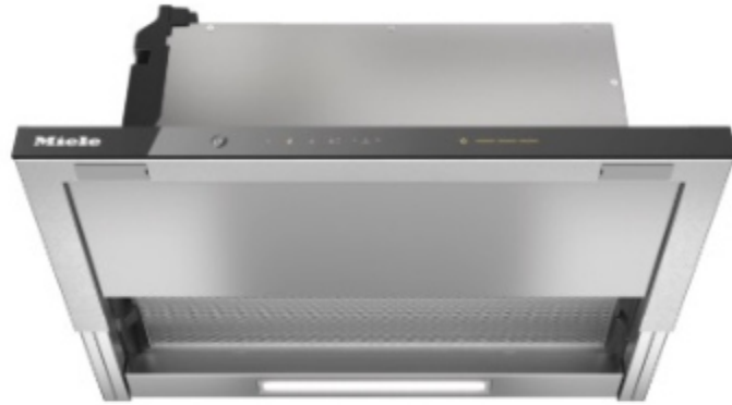
BUILT IN HOOD – 60CM