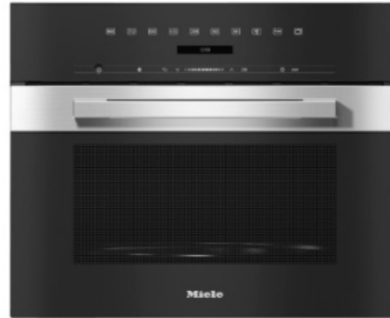
BUILT IN COMBINED MICROWAVE & OVEN