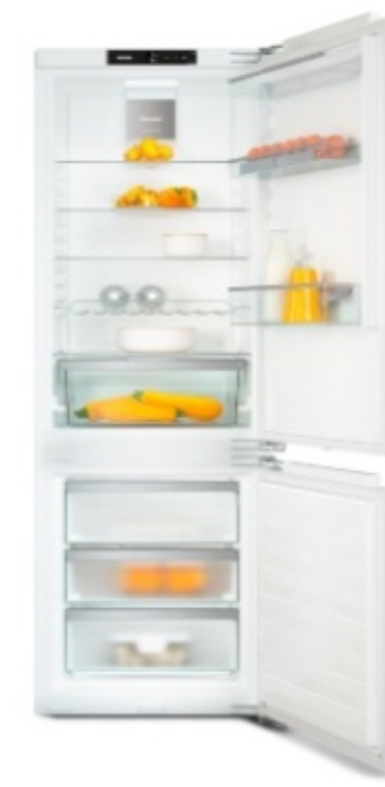
BUILT IN FRIDGE