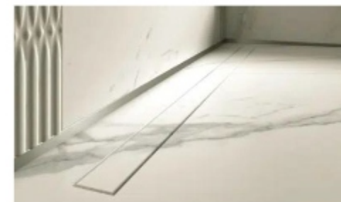
INVISIBLE COVER FLOOR DRAIN