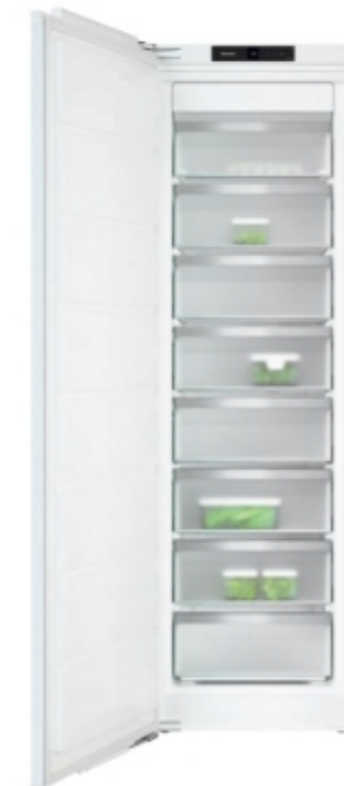
BUILT IN FREEZER