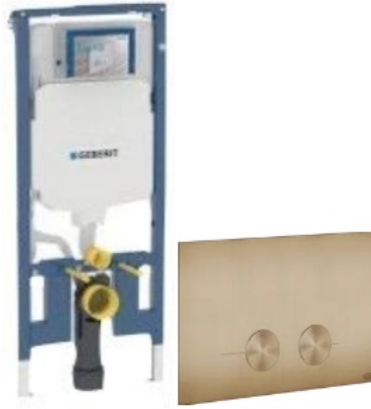
DUAL FLUSH PLATE & CONCEALED WALL-HUNG WC