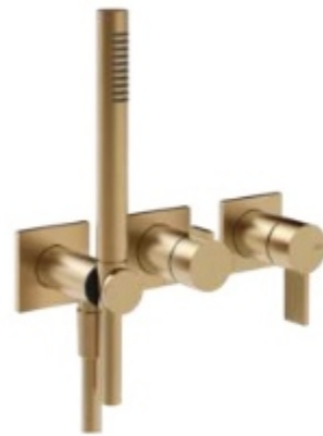
WALL MOUNTED BATH MIXER WITH DIVERTER, & HANDSHOWER HOLDER