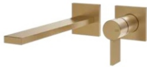
FREESTANDING MIXER BASIN WITH EXTERNAL PARTWALL-MOUNTED MIXER