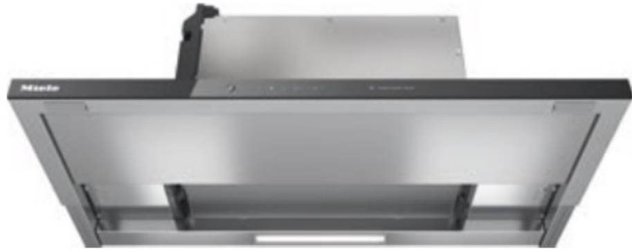
BUILT IN HOOD - 90CM