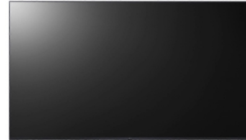
65- 70 INC TV (LIVING AREA ONLY)