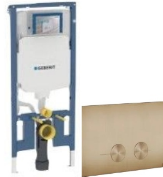
DUAL FLUSH PLATE & CONCEALED WALL-HUNG WC