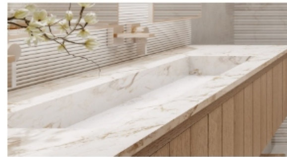
COSTUMIZED SLAB BASIN VANTIY