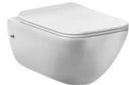
WALL HUNG CERAMIC WC