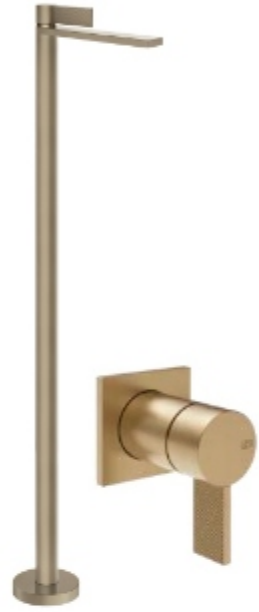
FREESTANDING MIXER BASIN WITH EXTERNAL PARTWALL-MOUNTED MIXER