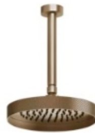
CEILING MOUNTED SHOWERHEAD