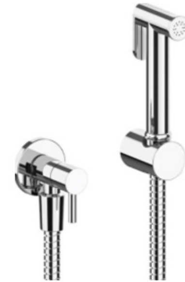
WALL MOUNTED HANDSPRAY