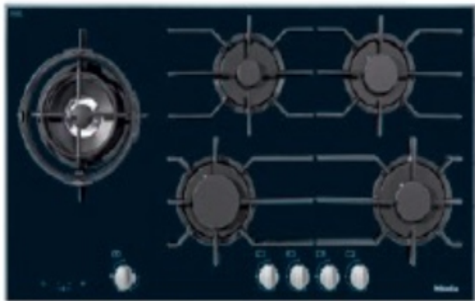
GAS HOB WITH 5 BURNERS - 90CM