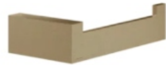
WALL MOUNTED TOILET ROLL HOLDER