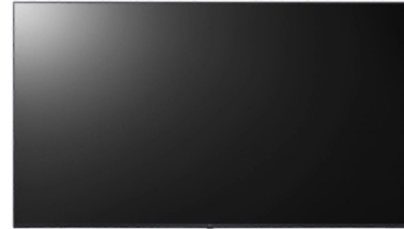
65- 70 INC TV (LIVING AREA ONLY)