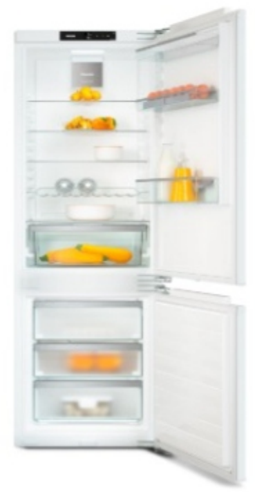
BUILT IN FRIDGE