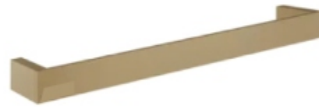
WALL MOUNTED TOWEL RAIL