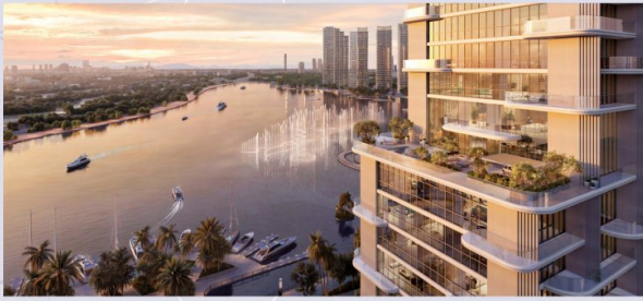
As global pioneers in architecture, engineering, and planning, SOM is renowned for shaping cities through sustainable innovation and bold, boundary-pushing design. Learn more about SOM architecture at som.com/som