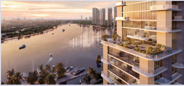
As global pioneers in architecture, engineering, and planning, SOM is renowned for shaping cities through sustainable innovation and bold, boundary-pushing design. © 2023 SOM Architecture. All rights reserved.