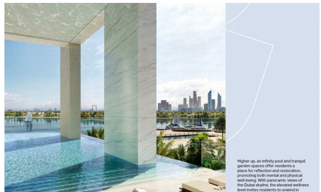
Higher up, an infinity pool and tranquil garden spaces offer residents a place for reflection and restoration, promoting both mental and physical well-being. With panoramic views of the Dubai skyline, the elevated wellness level invites residents to unwind in