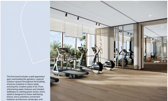
The first level includes a well-appointed gym overlooking the gardens. Layered outdoor spaces throughout the building immerse residents in nature while echoing the creative pulse of d3. From shimmering water features and shaded walkways to calming green zones, every detail is designed to foster well-being, leisure, and a seamless connection between architecture, landscape, and