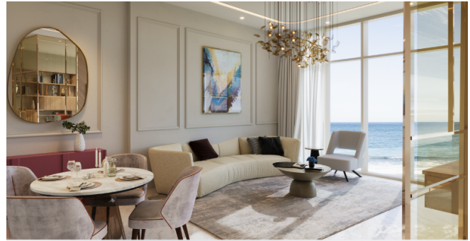
Fully furnished luxury apartments