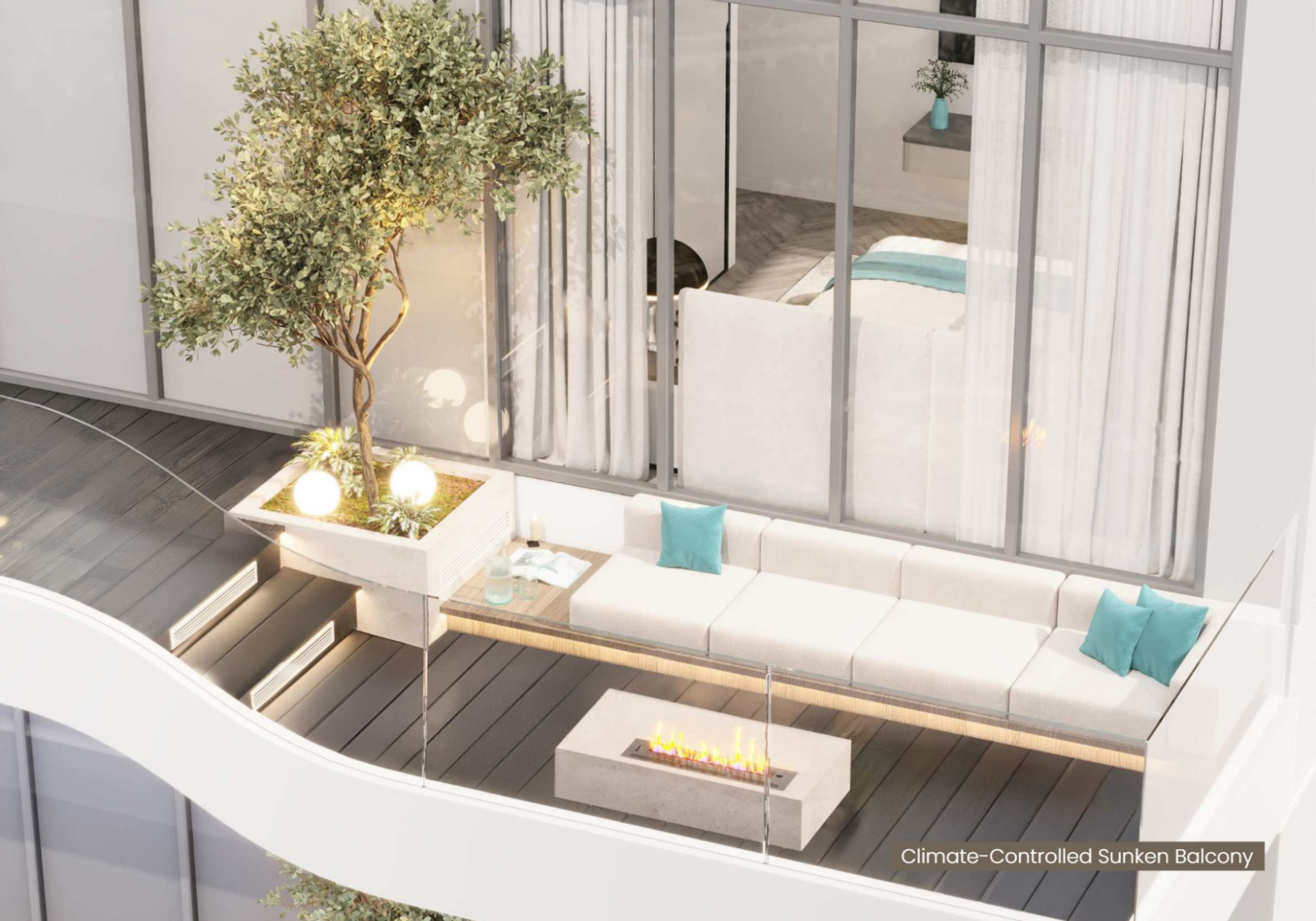
Climate-Controlled Sunken Balcony