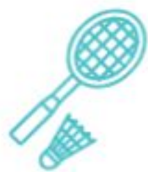
BADMINTON AND VOLLEYBALL COURT