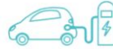
ELECTRIC VEHICLE RECHARGE STATION