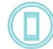
2X CRICKET PITCH