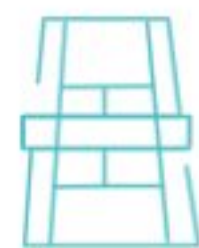
TENNIS AND PADDLE COURT