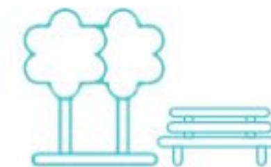
PRIVATE WINTER GARDEN