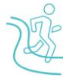
360 JOGGING TRACK