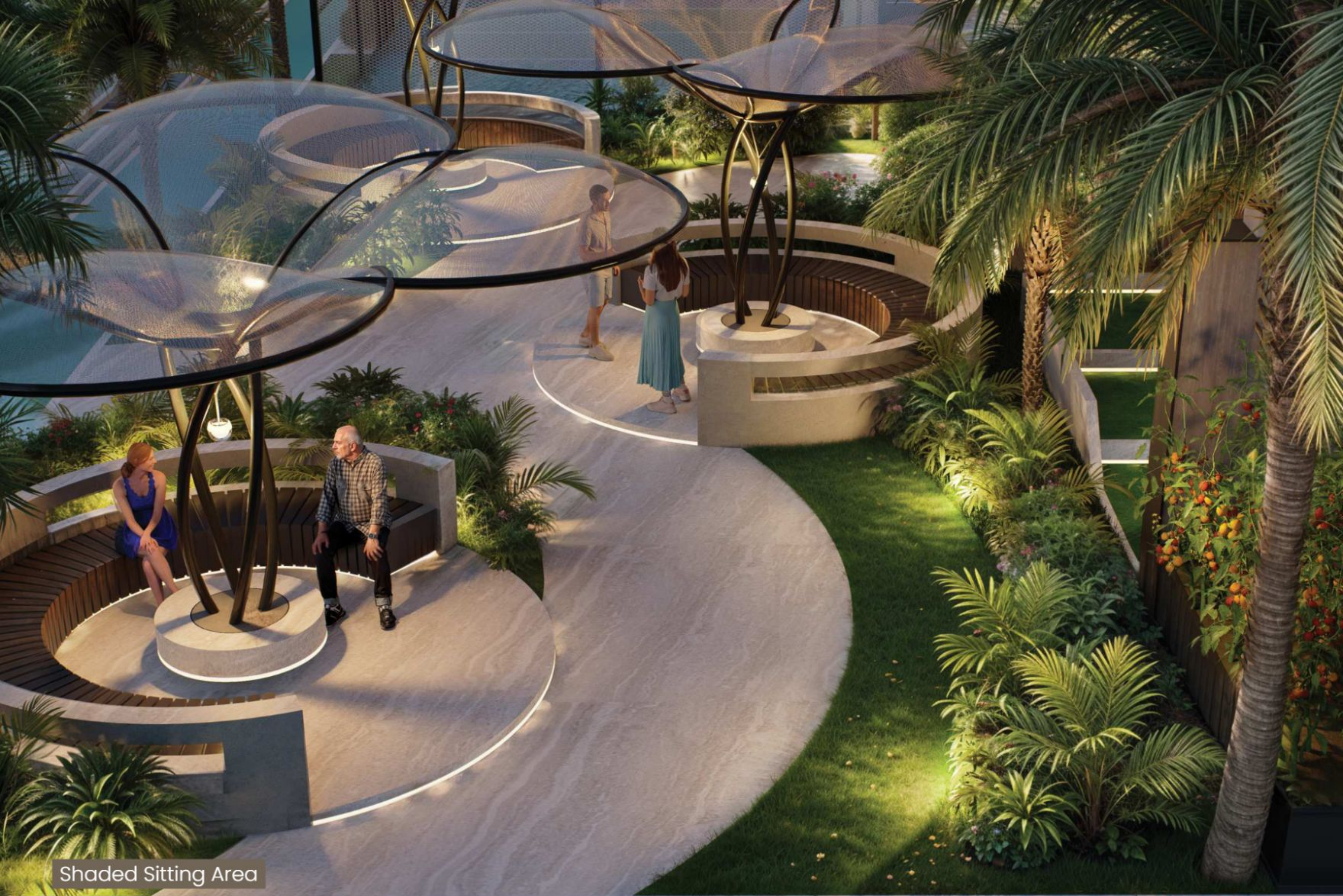
Shaded Sitting Area