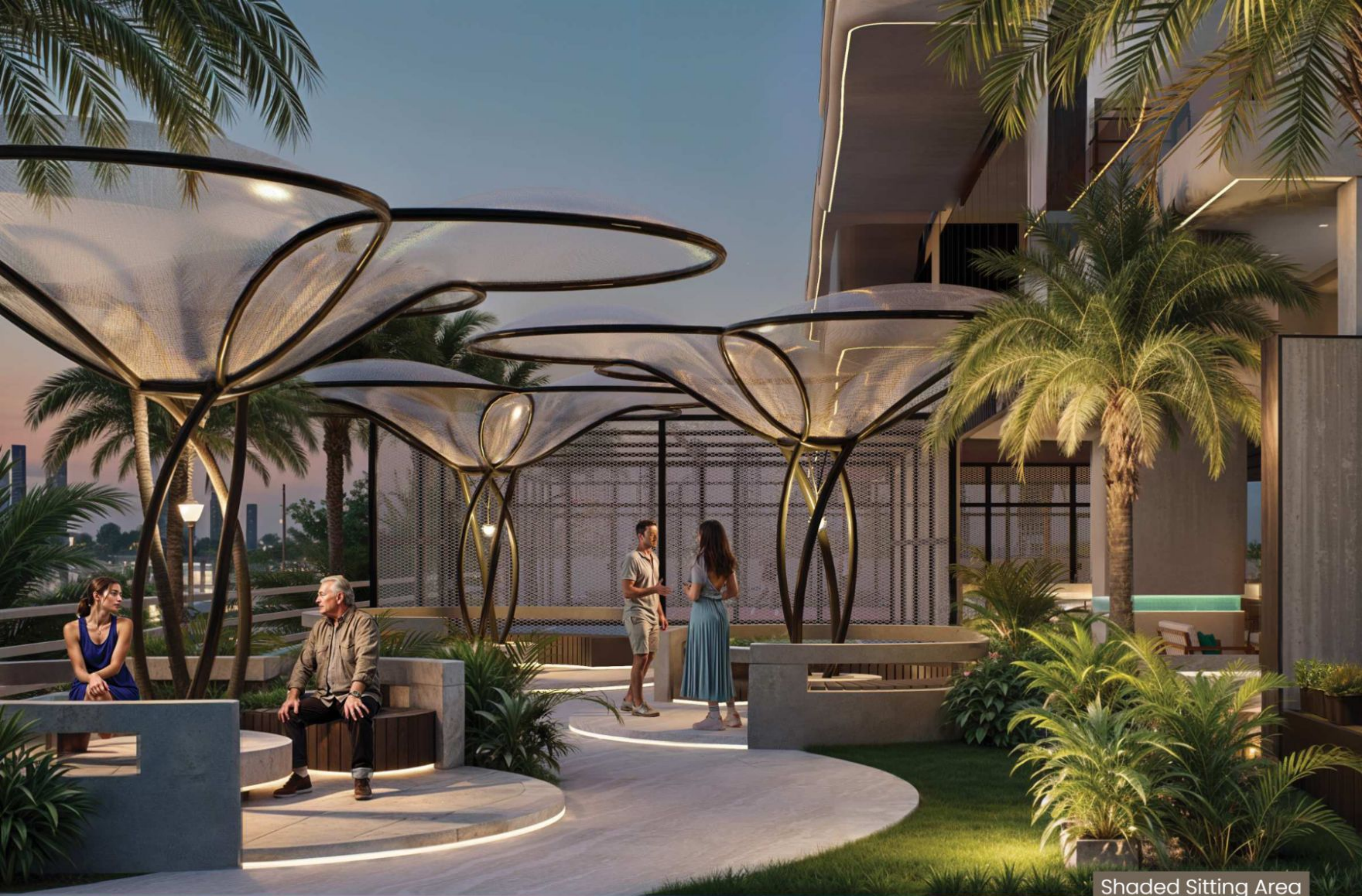
Shaded Sitting Area