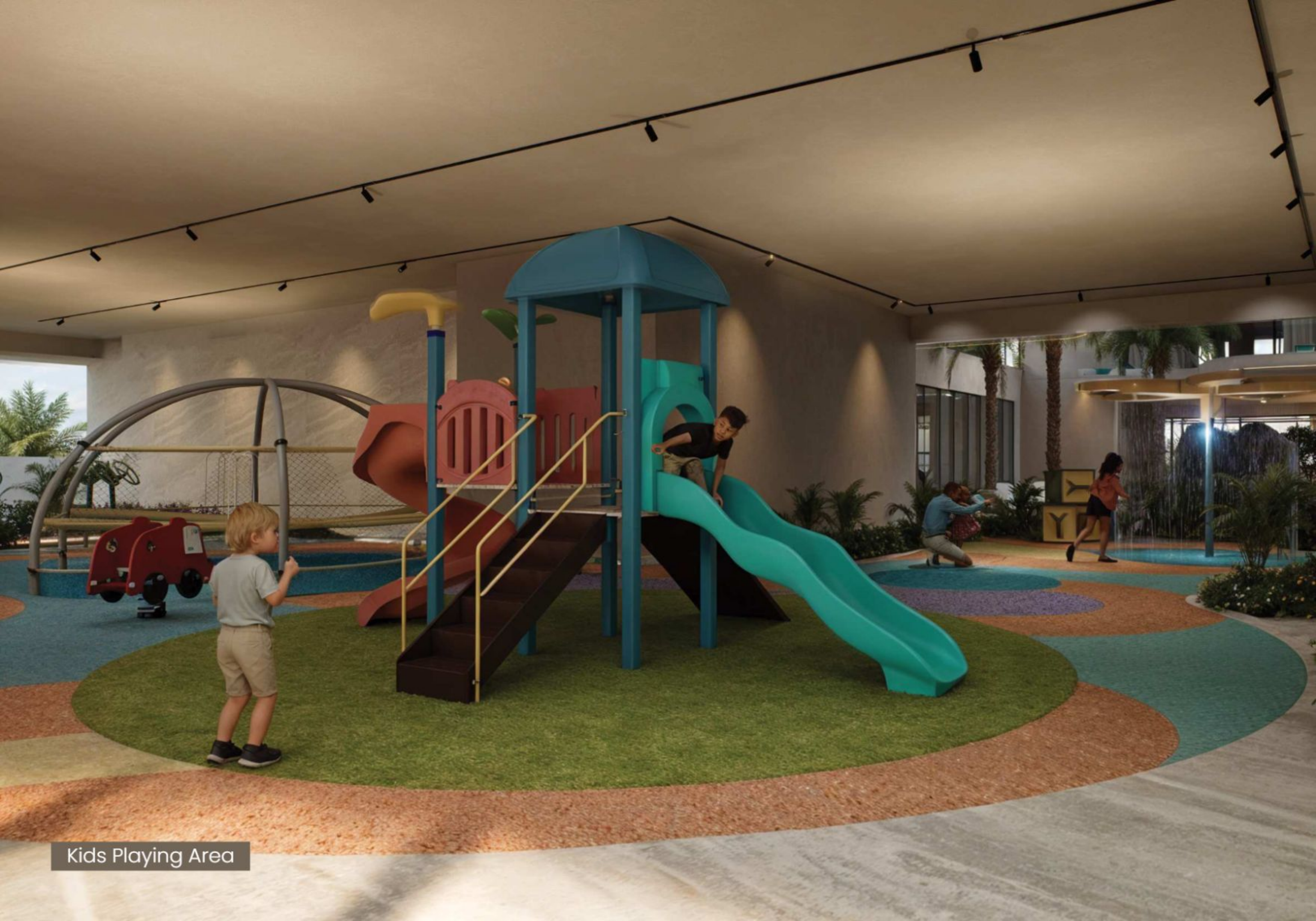
Kids Playing Area