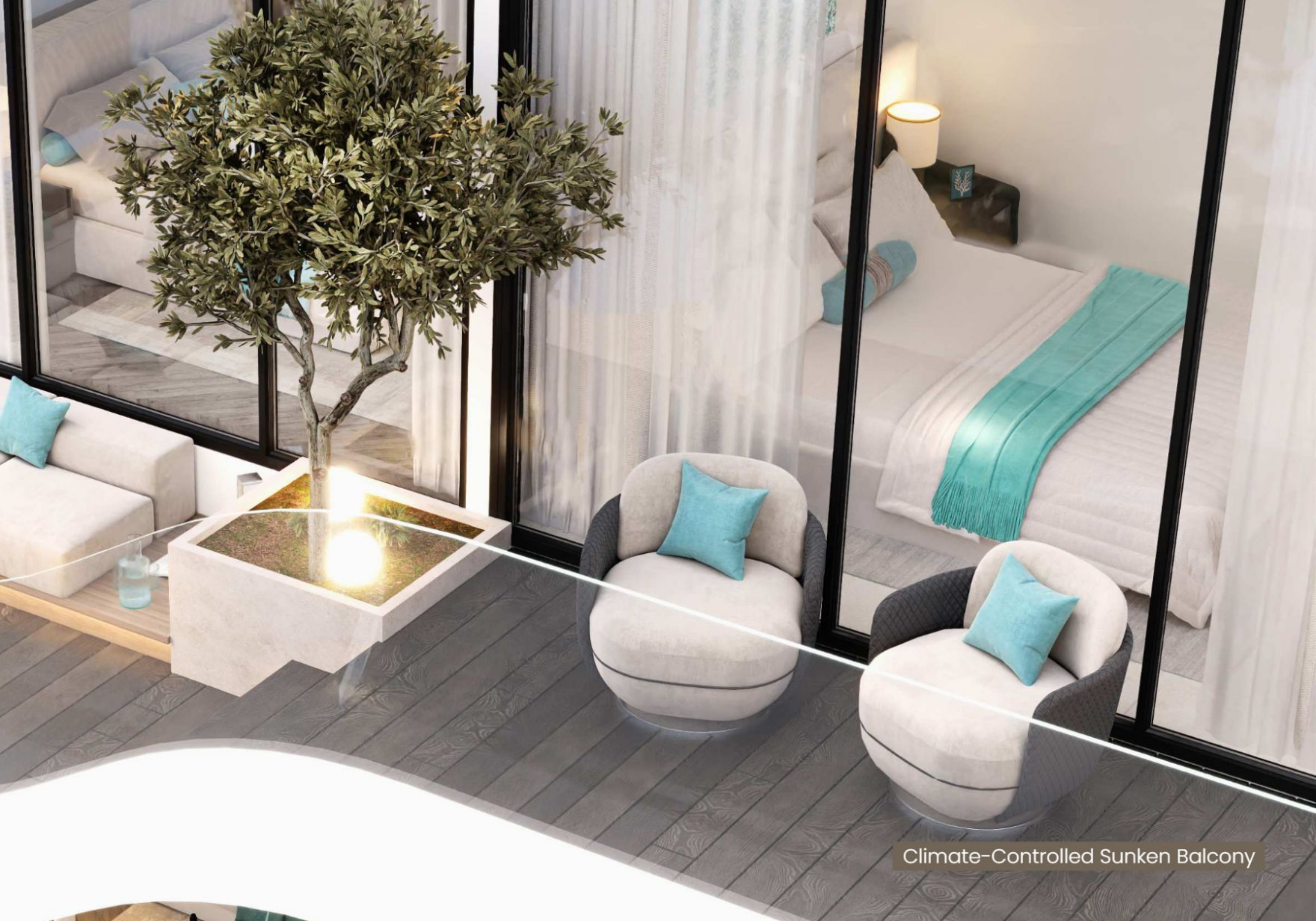
Climate-Controlled Sunken Balcony