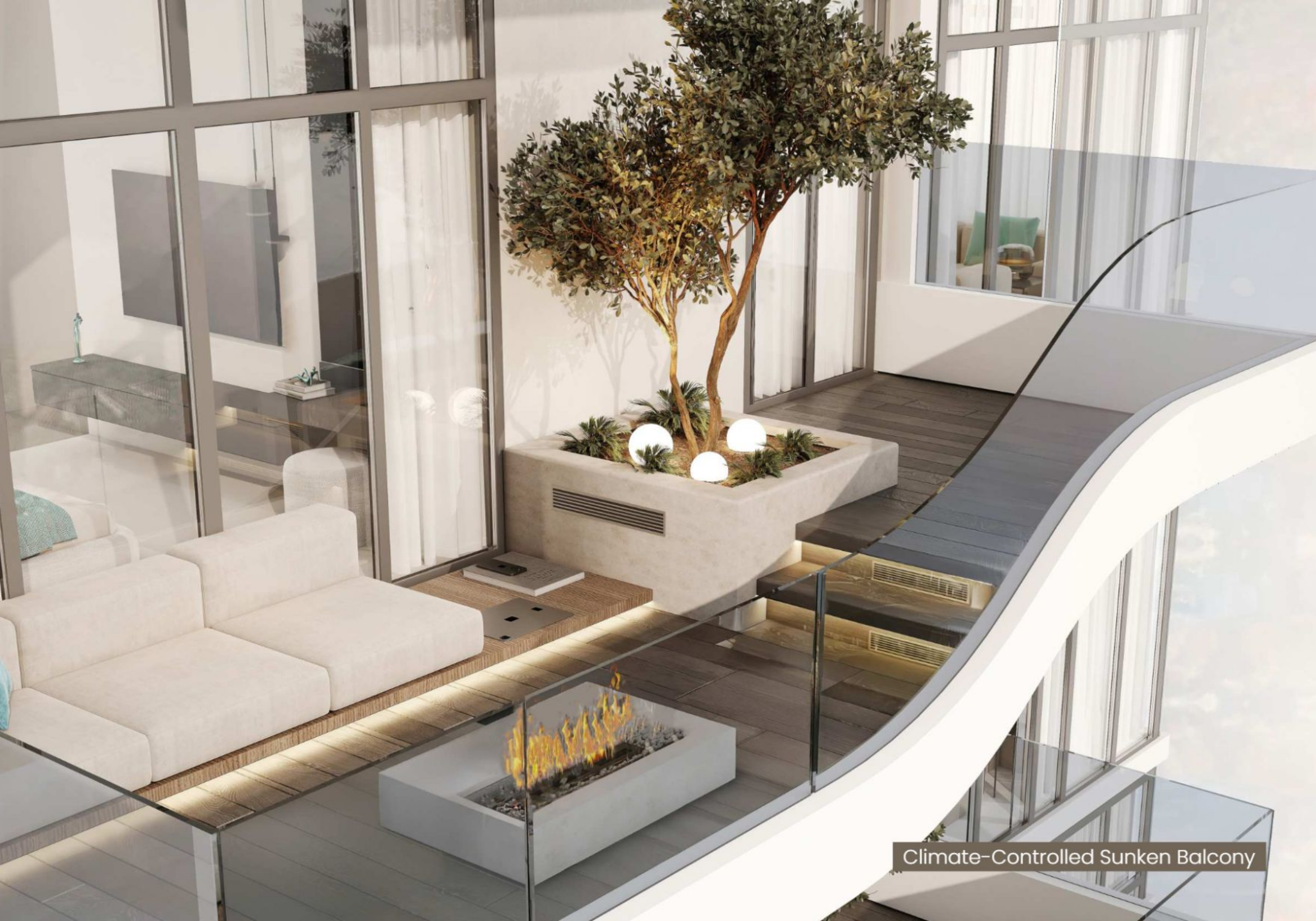
Climate-Controlled Sunken Balcony