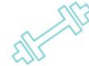
STATE OF THE ART GYM