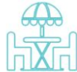
SHADED SITTING AREA