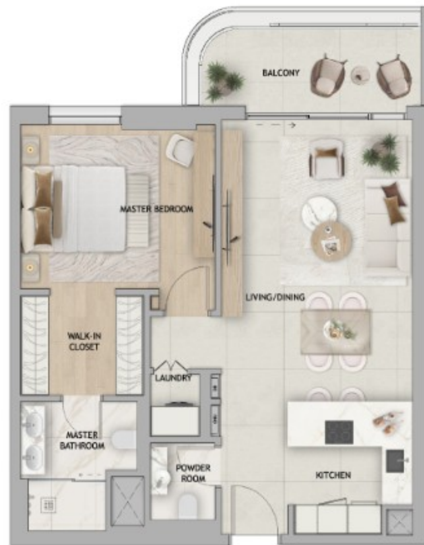
1-BEDROOM TYPE B1

Disclaimer: Image is indicative. Actual size and configuration of balconies will be specific to the unit.