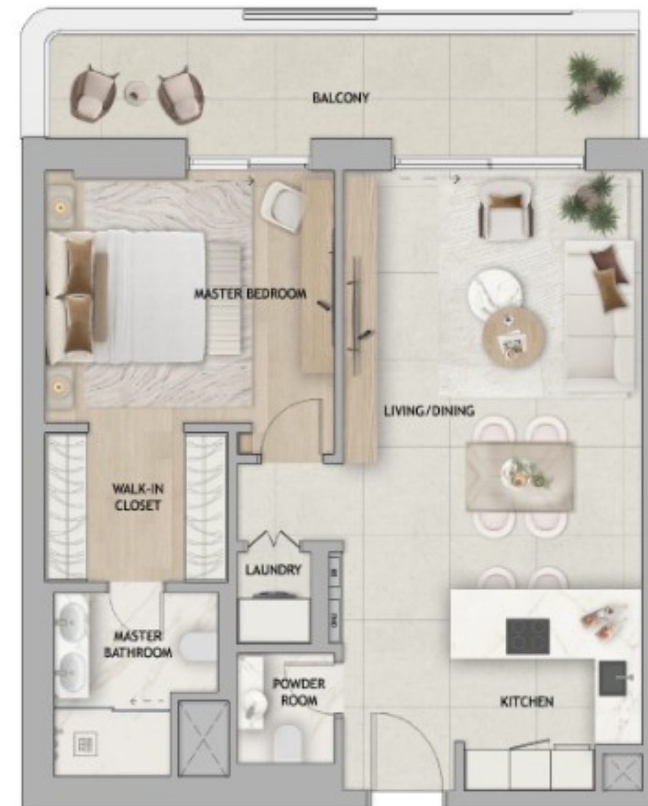
1-BEDROOM TYPE B2

Disclaimer: Image is indicative. Actual size and configuration of balconies will be specific to the unit.