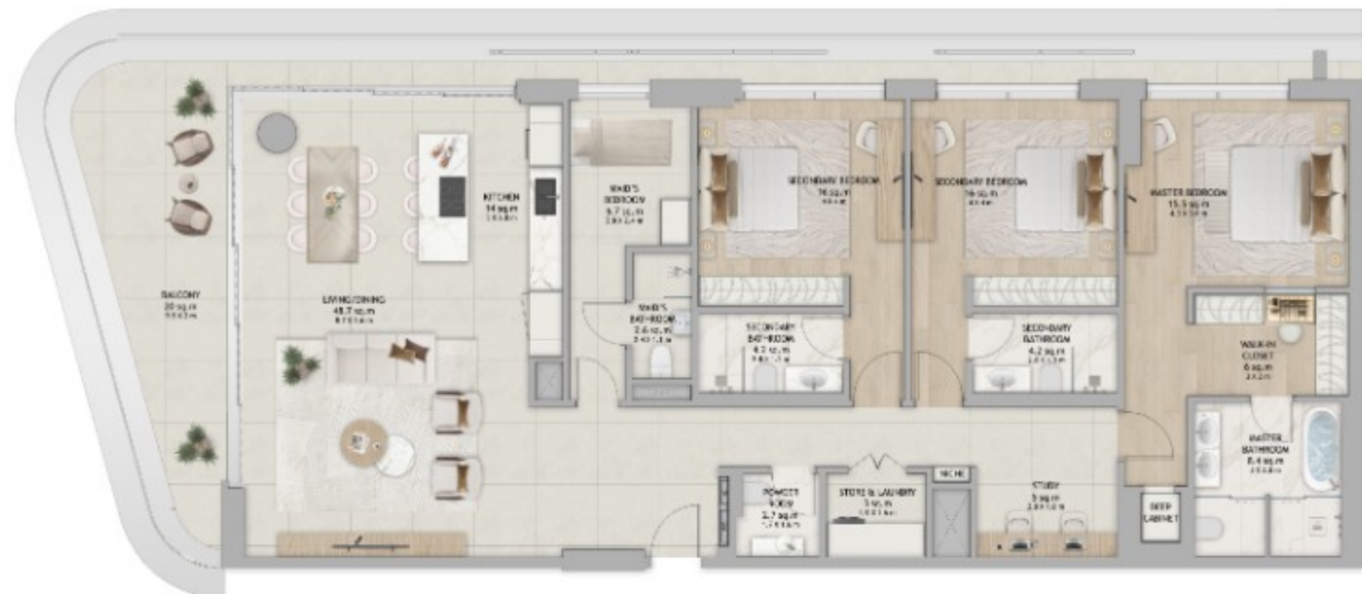
3-BEDROOM + MAID

Disclaimer: Image is indicative. Actual size and configuration of balconies will be specific to the unit.