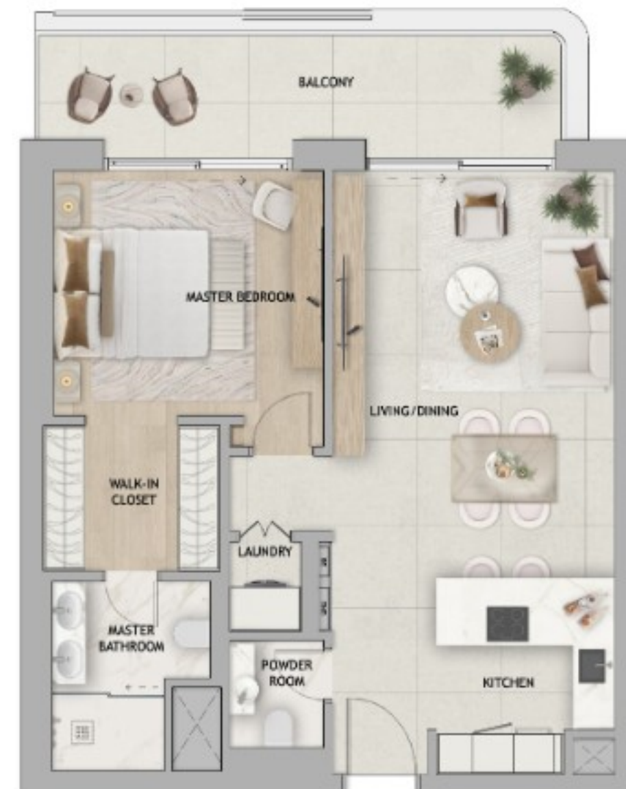
1-BEDROOM TYPE A

Disclaimer: Image is indicative. Actual size and configuration of balconies will be specific to the unit.