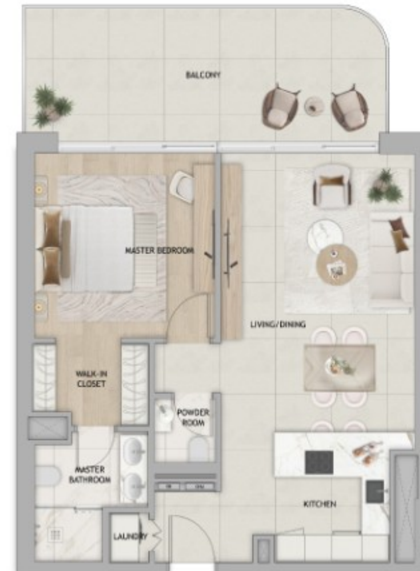
1-BEDROOM TYPE D

Disclaimer: Image is indicative. Actual size and configuration of balconies will be specific to the unit.