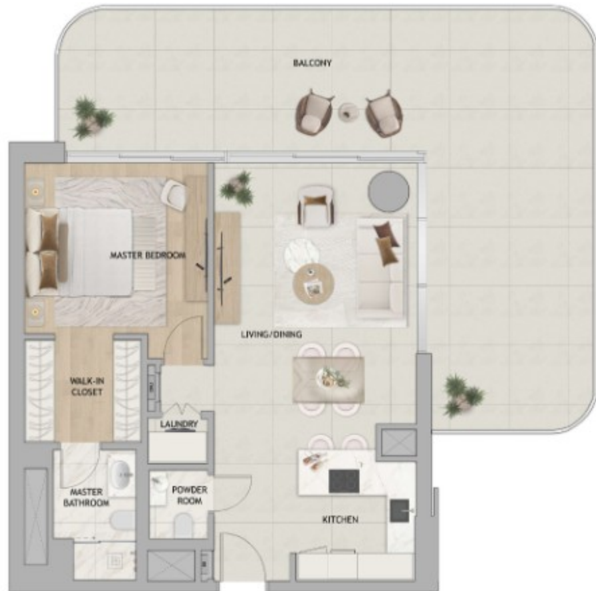
1-BEDROOM TYPE C

Disclaimer: Image is indicative. Actual size and configuration of balconies will be specific to the unit.